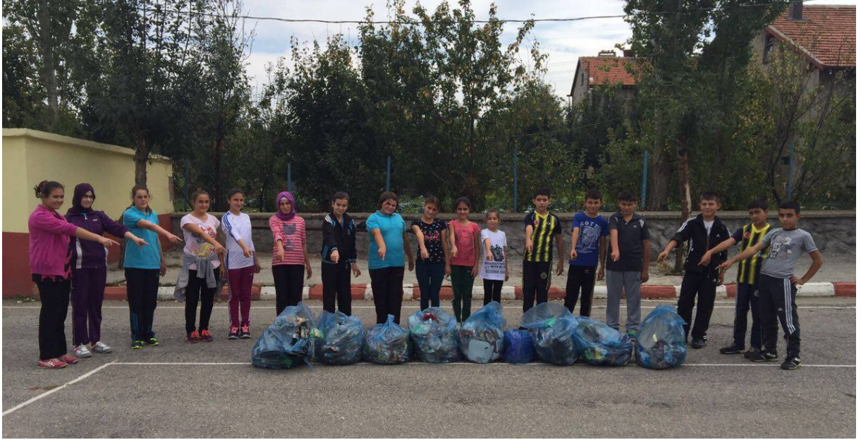
Tarařçı Secondary School garden