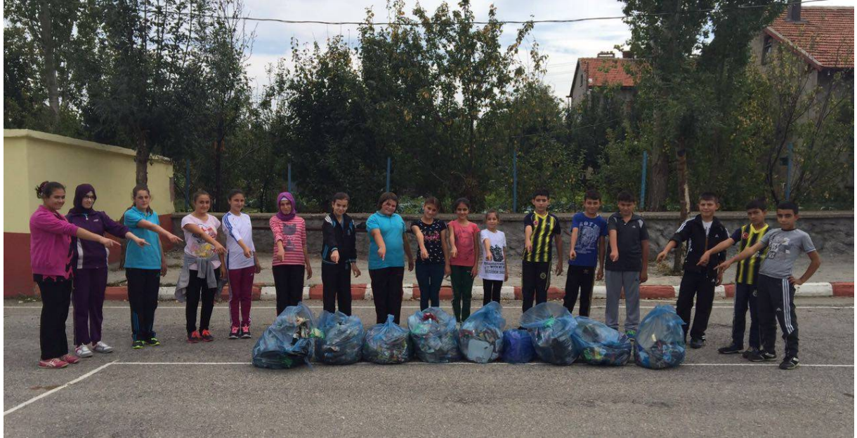
Taraşçı Secondary School garden